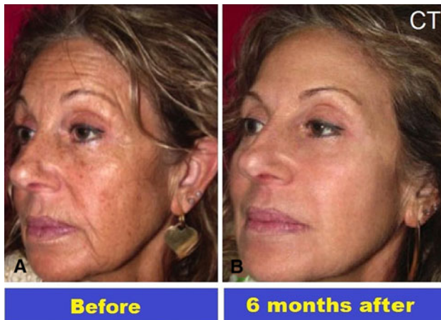
Fig. 5 A 51-year-old woman a before and b 6 months after complete treatment (CT) of the left half-face. Significant improvement is shown by the following pattern of results in terms of the 5-point grading scale (0–4GS): a pigmentation (P) = 4, fine lines/wrinkles (W) = 3, overall aging (OA) = 3; b P = 0, W = 0, OA = 0; 0–5GAIS = 5, VAS1A = 68, VAS1B = 29, VAS2A = 64, VAS2B = 37. 0–5GAIS, 6-point Global Aesthetic Improvement Scale; VAS visual analog scale

advantage of a faster recovery after each session due to the lower power settings of the medium and low programs. However, although the use of the high program in one single session means a longer recovery period, patients have to go through it only once, and the total number of days for recovery is shorter.